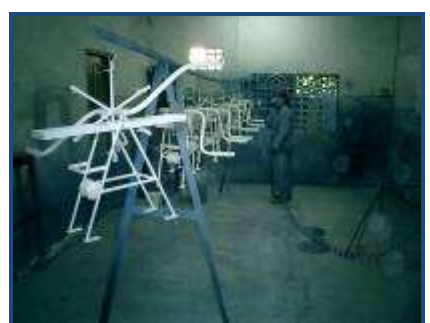
Process: cutting, welding, painting, gluing, assembly, quality control