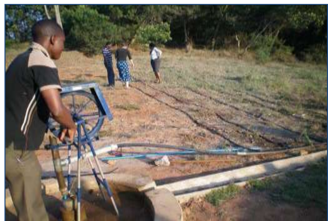
Drip irrigation rope pump in Malawi