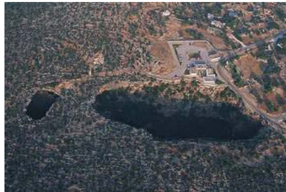
Hell & Heaven Caves