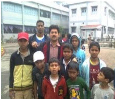
Some of the upstairs boys in Gangarampur (above and below)