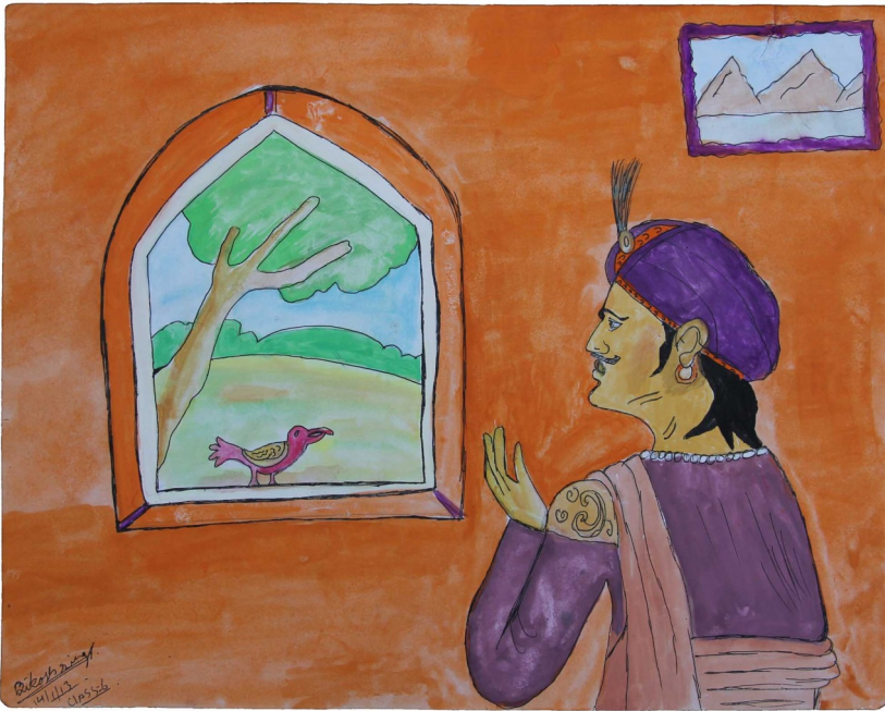
Bikash Singh, Class 6