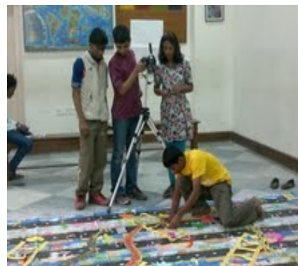
Pupils shooting the animation