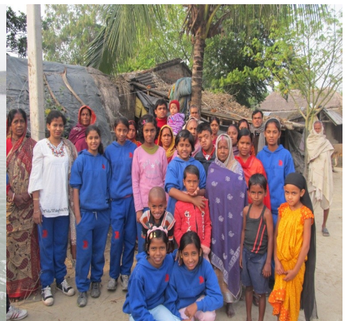
The girls on a boat on the river (left) and at Ganga Uncle's house with visitors (right)