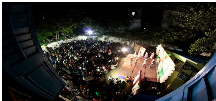
The crowd at Rowland Road during the Mela