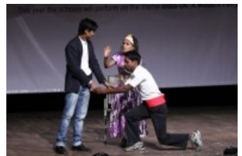
Some scenes from the play (left, middle, right)