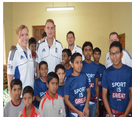
Stuart Broad and his sister, Bresnan and some Future Hope boys