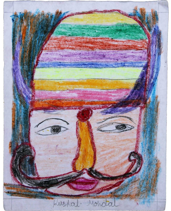
Kushal Mondal, Fast Track