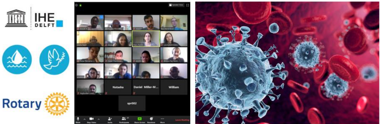
Rotary Host-Counselor support in Corona times

In times of crisis, it is important to take care of each other. The Rotary-IHE committee in the Netherlands and the Dutch Rotary host-counselors checked in regularly on all the Rotary-sponsored students at IHE Delft in virtual Zoom connects to see how they all are doing, how their families are doing back home and whether Rotary can be of any help and support. These are times of unprecedented challenges and together we will get through. We were impressed by the determination and resilience of our students. They are on a mission to obtain their MSc diploma, and they all will succeed!