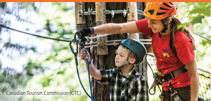
Canadian Tourism Commission (CTC)

Plan for additional days of travel before and after the convention so you can bask in the beauty, majesty, and relaxation that await a short flight or drive away.