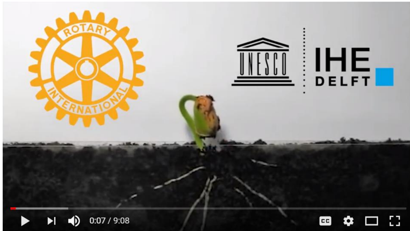
Rotary - IHE Delft Partnership 2018