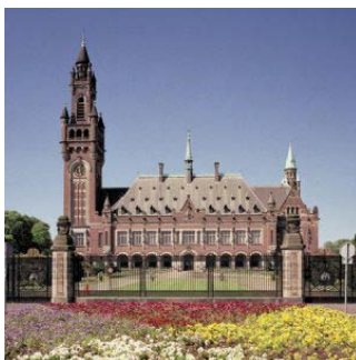
The Hague, Peace Palace

At the end of the first week we will bring you to your hosts in Lingewaard-Bemmel/Nijmegen- Zuid.