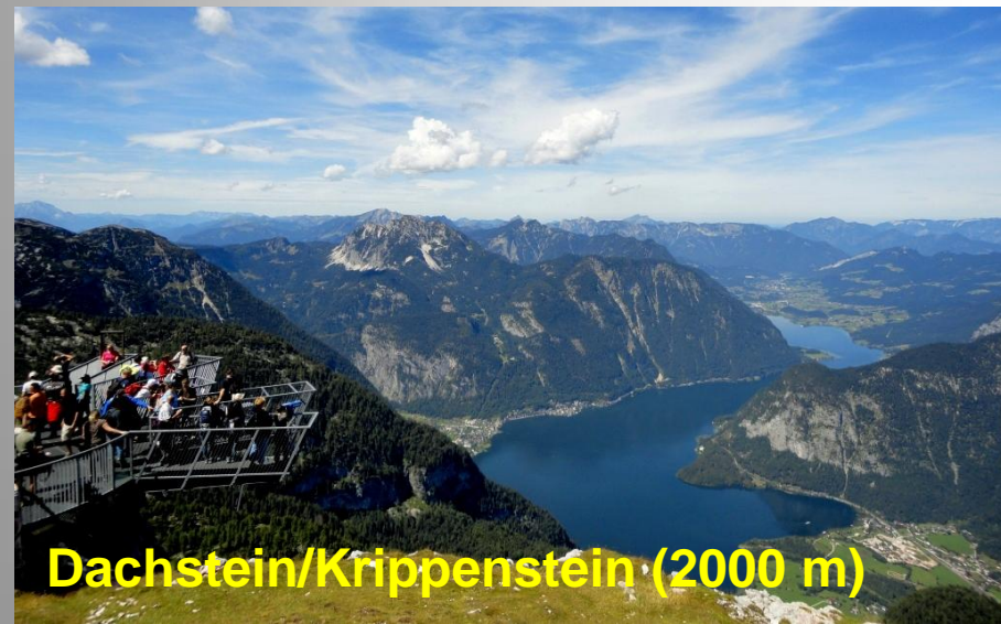
Dachstein/Krippenstein (2000 m)