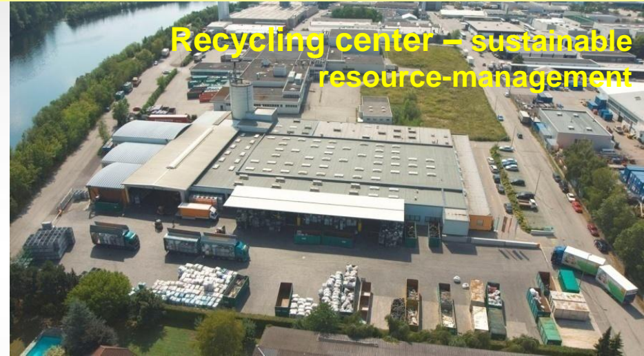
Recycling center – sustainable resource-management