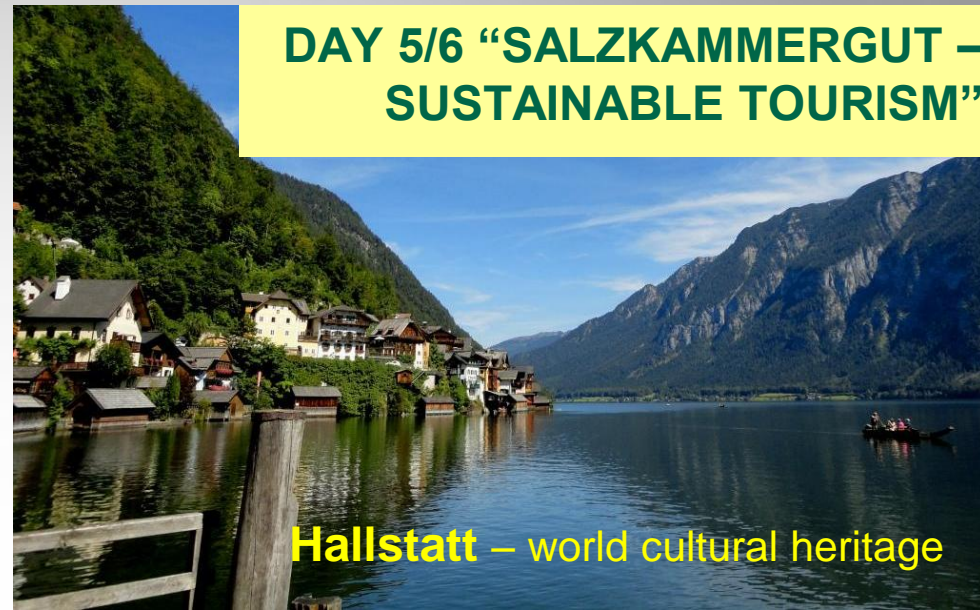
Hallstatt – world cultural heritage