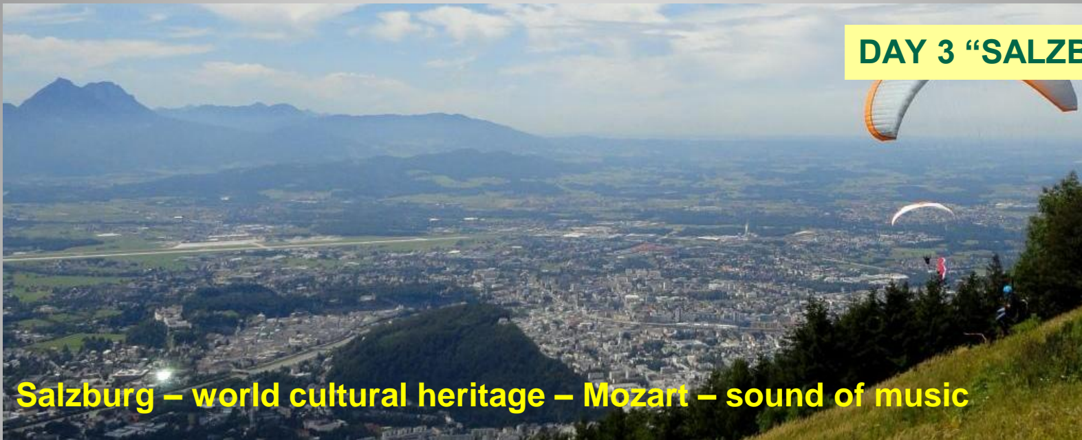
Salzburg – world cultural heritage – Mozart – sound of music