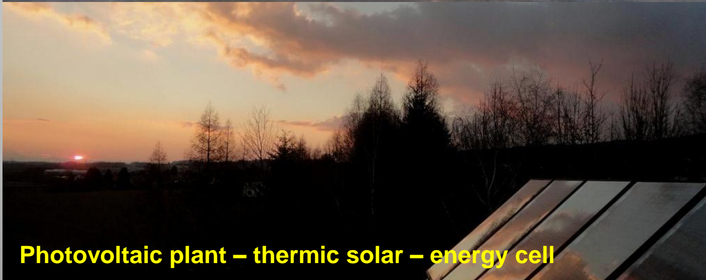
Photovoltaic plant – thermic solar – energy cell