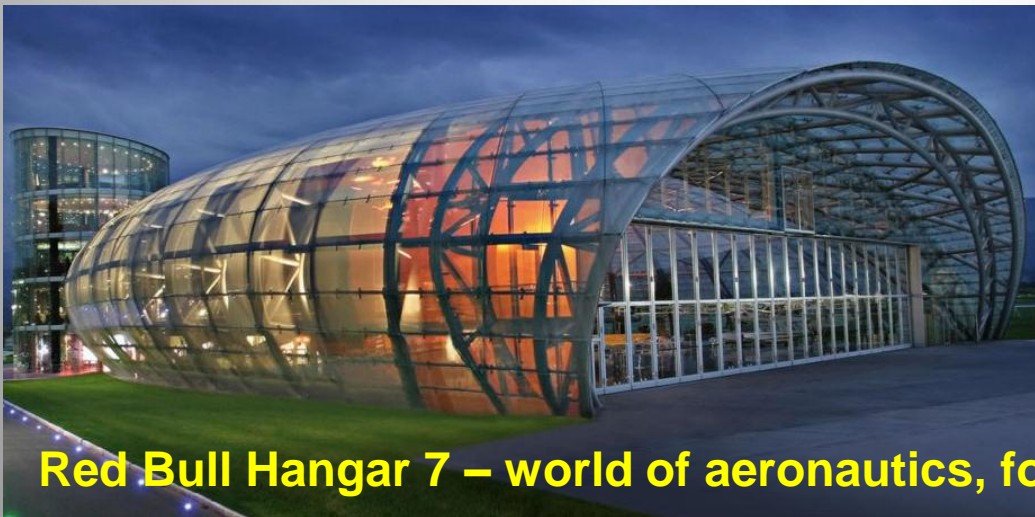
Red Bull Hangar 7 – world of aeronautics, formula 1 .....