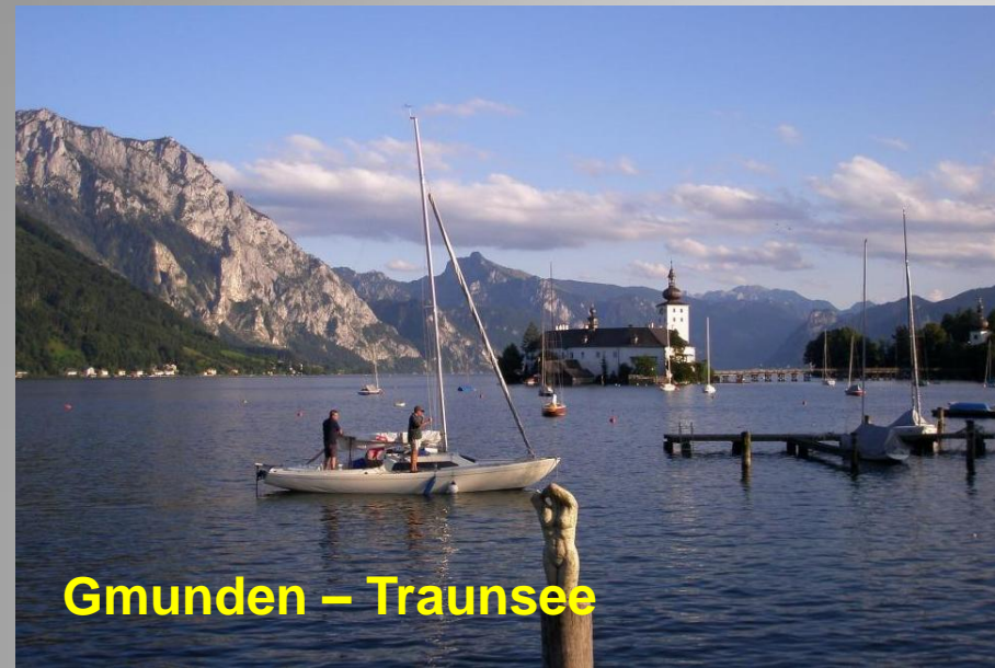
Gmunden – Traunsee