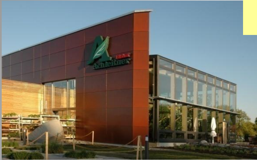
Biohof Achleitner, Eferding sustainable food production & retailing