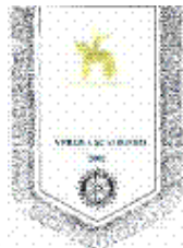
Verona Scaligero 2002