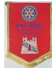
San Vito al Tagliamento