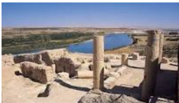
Gaziantep Zeugma Antique City