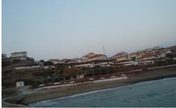
Antakya - Arsuz Artemis Summer Houses