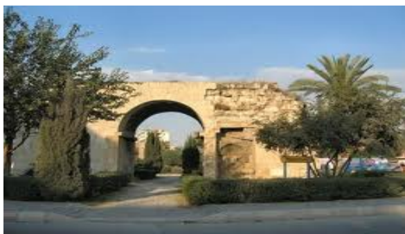
Tarsus Cleopatra Gate