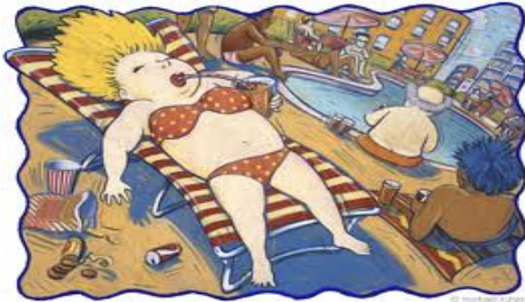
Sun Bathing ☺