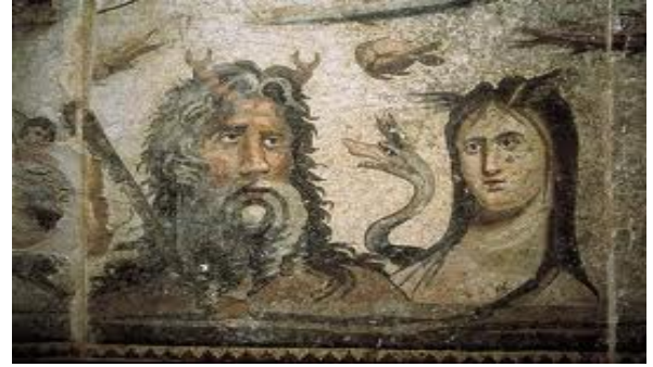
Gaziantep Zeugma Mosaic Museum