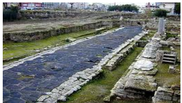
Tarsus Antique Road