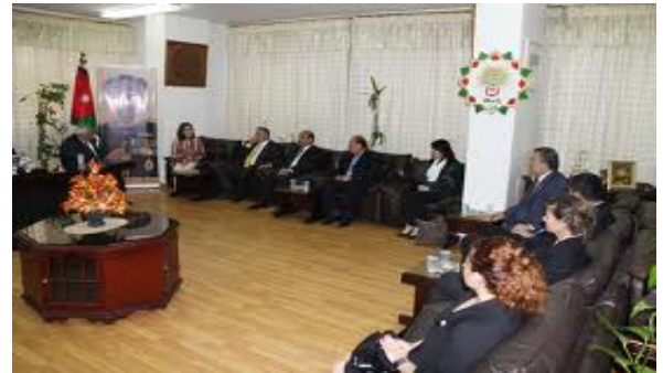
Gaziantep Mayor Visit