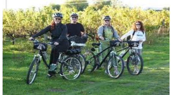
Country Bicycle Tour