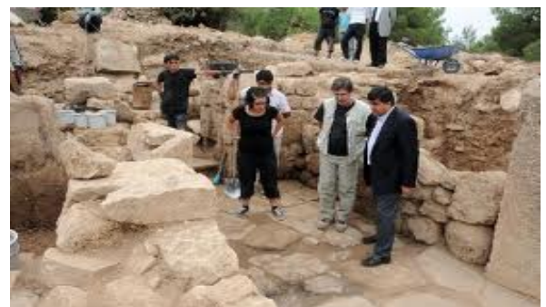
Gaziantep Dülük Antique City