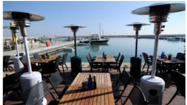
Mersin Marina Visit