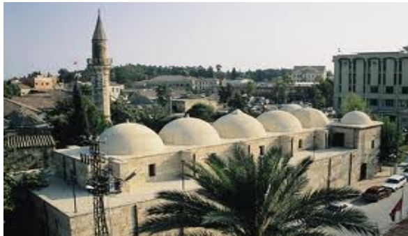
Tarsus Kırkaşık Bazaar