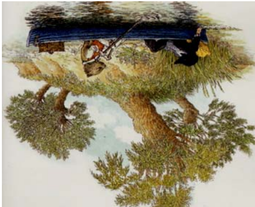
An image from The Wind in the Willows by A A Milne. Picture by Patrick Benson

Camp of: District 1070 in Cambridgeshire, England, 2013