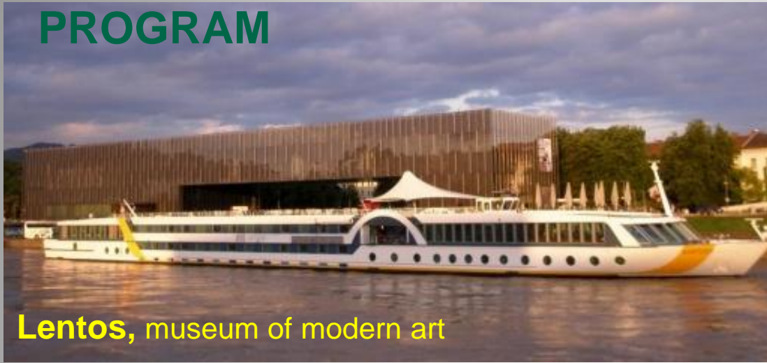
Lentos , museum of modern art