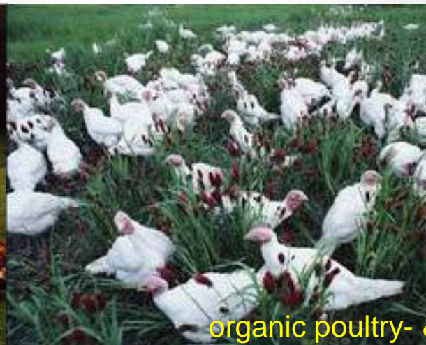
organic poultry- & egg-production