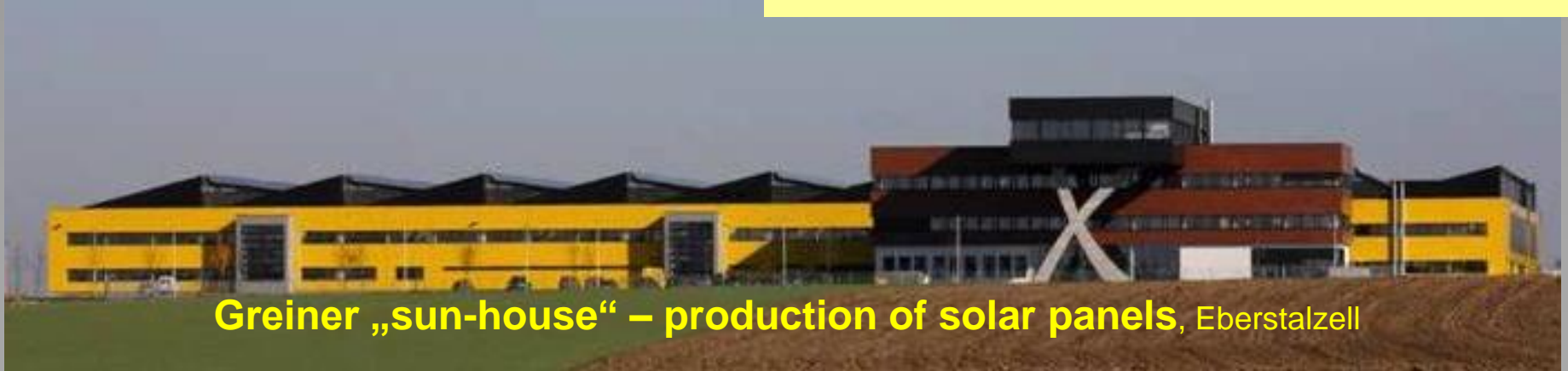
Greiner „sun-house“ – production of solar panels, Eberstalzell