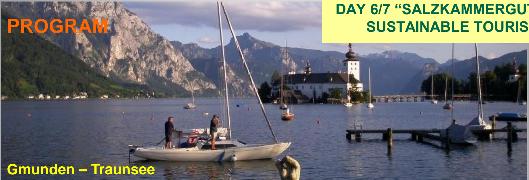
Gmunden – Traunsee