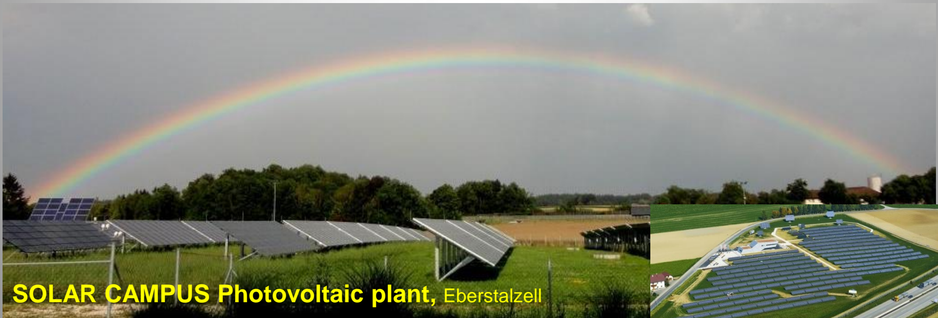
SOLAR CAMPUS Photovoltaic plant, Eberstalzell