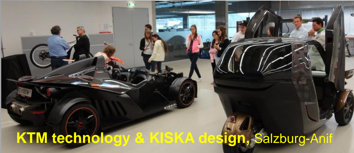
KTM technology & KISKA design, Salzburg-Anif