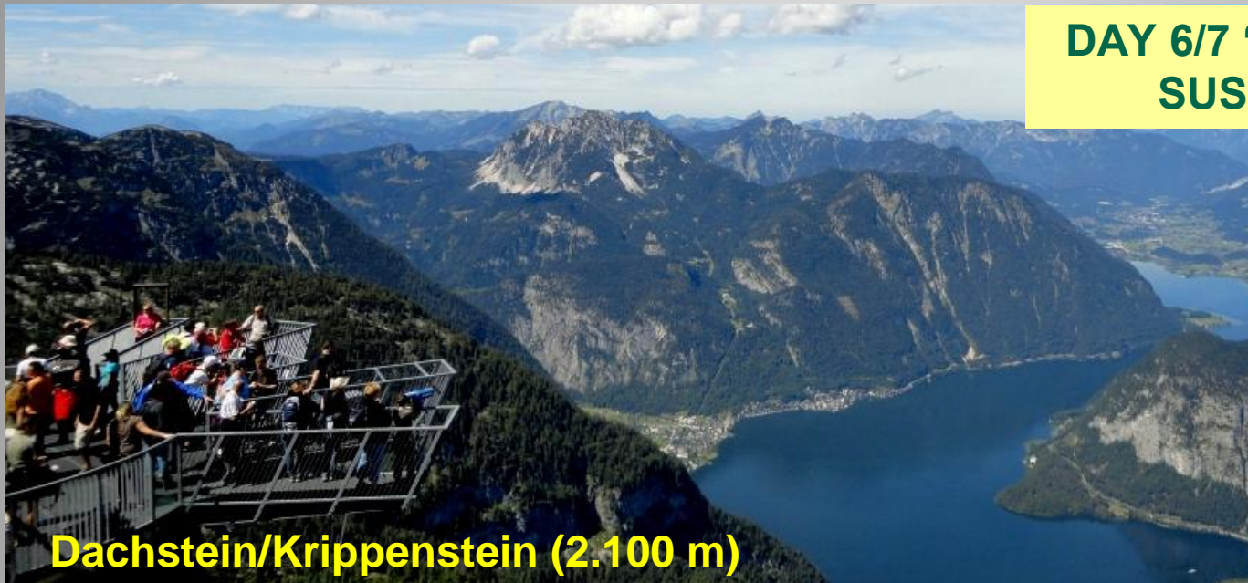
Dachstein/Krippenstein (2.100 m)