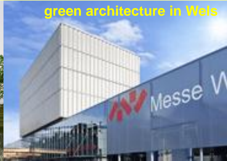
green architecture in Wels