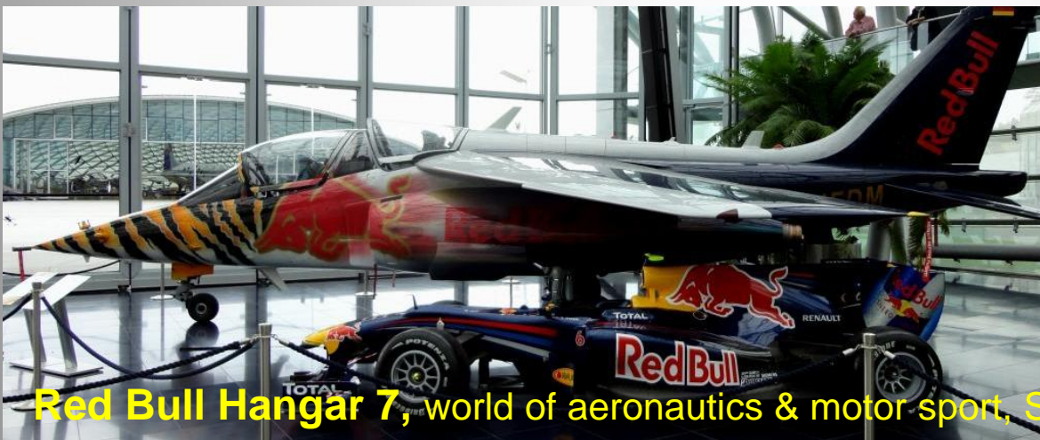
Red Bull Hangar 7, world of aeronautics & motor sport, Salzburg