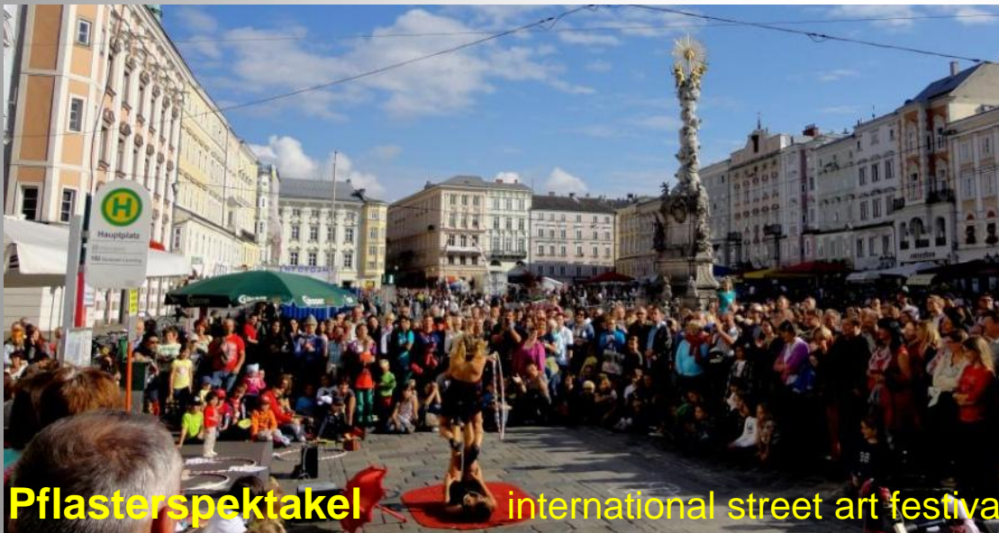
Pflasterspektakel international street art festival