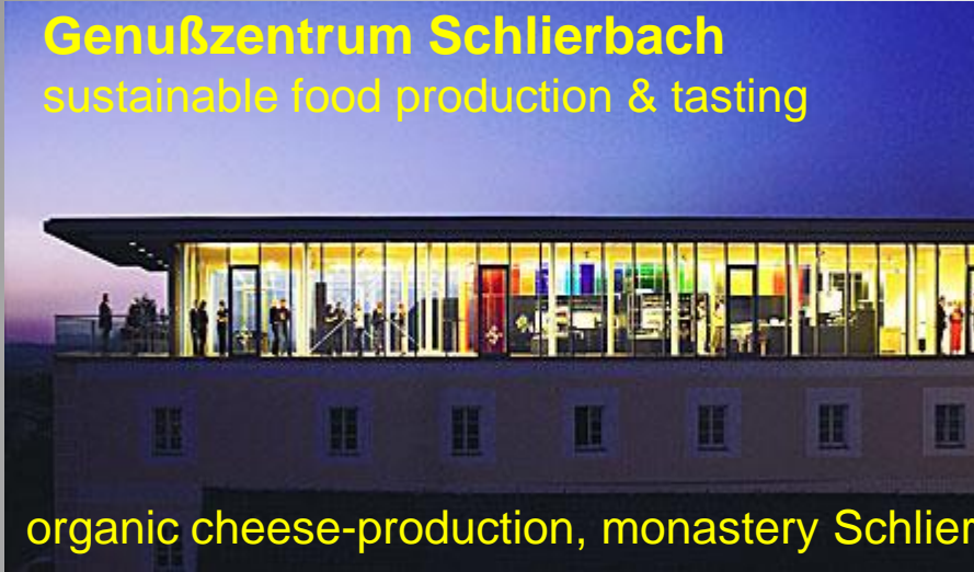
organic cheese-production, monastery Schlierbach

Genußzentrum Schlierbach sustainable food production & tasting