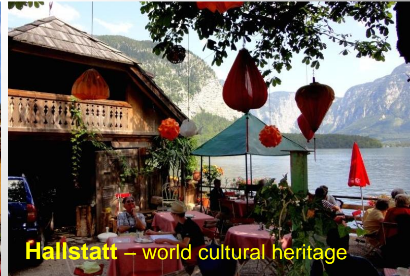
Hallstatt – world cultural heritage