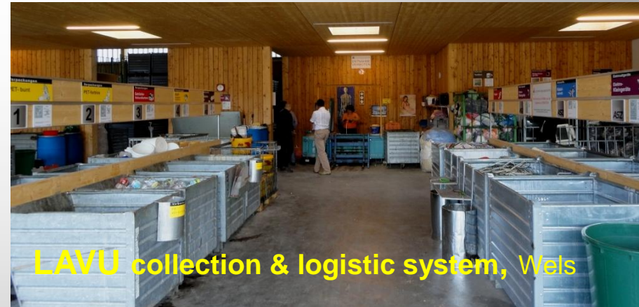
LAVU collection & logistic system, Wels