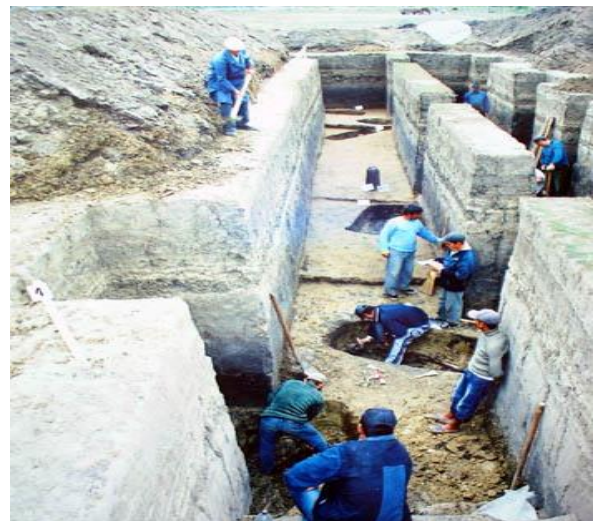
Necropola de sec. IV p. Ch. din satul Polocin aspect general, secțiunea 8-9, Campania 2003

The 4-th century AD necropolis in the Village of Polocin A glass bead