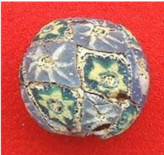
Necropola de sec. IV p. Ch. din satul Polocin Mărgică din sticlă

The 4-th century AD necropolis in the Village of Polocin A glass bead