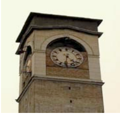
Adana Clock Tower