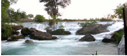
The Tarsus Waterfall