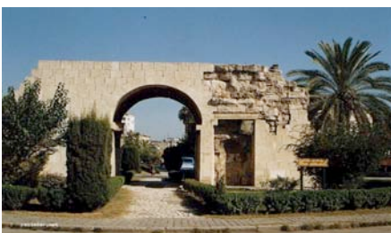
The Cleopatra Gate