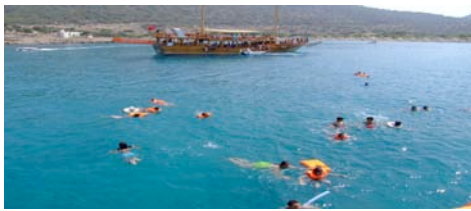
Taşucu Boat Tour