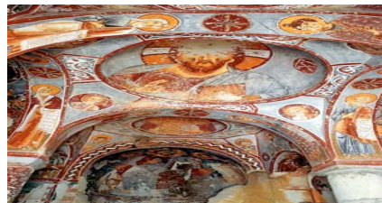
Churchs of Göreme